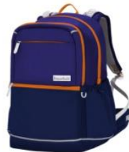
9007-01 Dark Blue